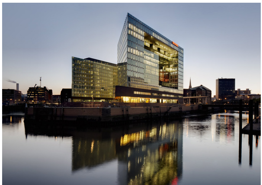
Spiegel Verlag's headquarters in Hamburg's HafenCity.

Week after week, more than 14 million people choose to engage with the content developed by the Spiegel group. Because their flagship publication, Der Spiegel, is published on a weekly basis, digital assets are only critical for a few days. The group wanted to implement an active archive strategy to protect videos and editorial content by creating a third copy of their digital assets in a user-accessible storage repository. An active archive intelligently monitors and migrates data across multiple storage devices, reduces recall time of an archive file and monitors the integrity of digital assets to eliminate the risk of loss from bit rot, corruption, failed technology or bad media. This strategy provides virtually limitless storage capacities in a much smaller footprint and cost per gigabyte.