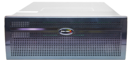
Spectra BlackPearl NAS

Markus Blesgen, IT operations, Spiegel Verlag