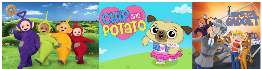
Teletubbies, Chip & Potato and Inspector Gadget are some of the loved kids’ and family brands owned by WildBrain.

WildBrain acquired a complete solution from Spectra Logic. Over the course of 10 months, WildBrain deployed Spectra’s BlackPearl® Hybrid Storage Platform, a Spectra® Stack® Tape Library and a Spectra NAS Solution. Spectra’s BlackPearl is a modern object storage solution that manages multiple storage targets in a single Perpetual Tier of storage, including object storage disk, tape and cloud. The feature-rich platform can replicate remotely or locally to other BlackPearl systems for failover and high availability. Per WildBrain’s custom storage policies, BlackPearl automatically makes two copies of their database