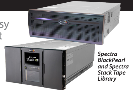
Spectra BlackPearl and Spectra Stack Tape Library