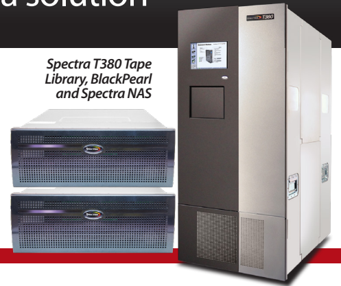
Spectra T380 Tape Library, BlackPearl and Spectra NAS