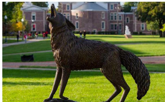
The Legacy Supercomputer is named after the 'Legacy' sculpture on USD's Vermillion campus

To manage a growing supercomputing infrastructure and expanding user base, USD launched the South Dakota Data Store (SDDS) project. The SDDS proposed two service tiers to serve all faculty, staff, postdocs, students and graduate students in South Dakota – the Sharing Tier and the Archival Tier.