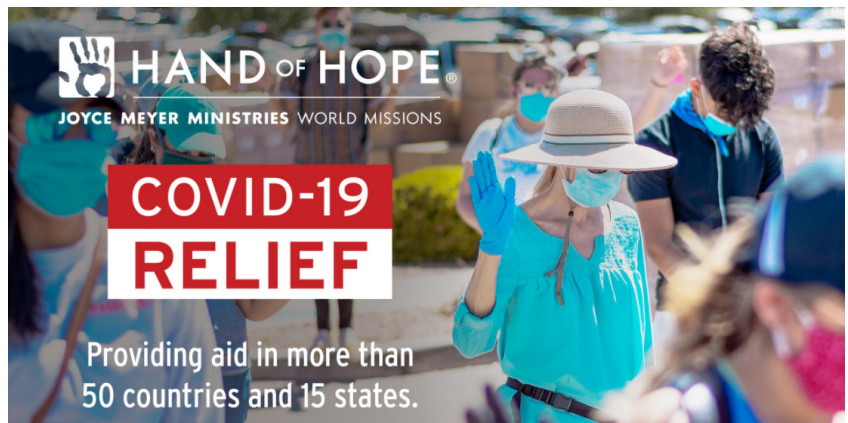
Hand of Hope is the missions arm of Joyce Meyer Ministries. In response to the coronavirus pandemic, they are helping to feed those affected, provide medical supplies and more.

When it came time to replace their archive software and upgrade their tape drives, the ministry knew they could turn to Spectra. They added to their storage