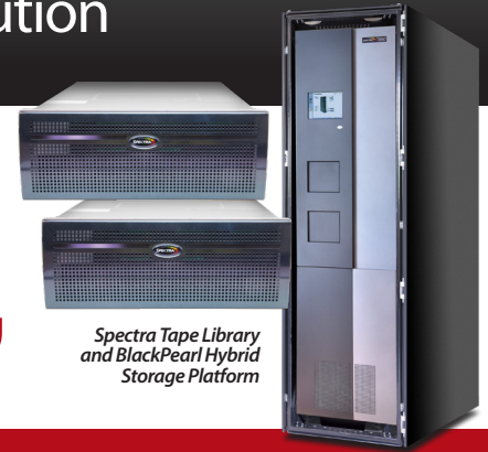
Spectra Tape Library and BlackPearl Hybrid Storage Platform