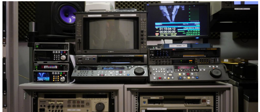
Video cassette digitisation in the BFI National Archive

The new digital repository needed to integrate with existing workflow applications, be flexible with future applications, and accommodate predicted data growth. The BFI team was also concerned about being locked into a single vendor’s technology drive and media roadmap. They relied on the trusted