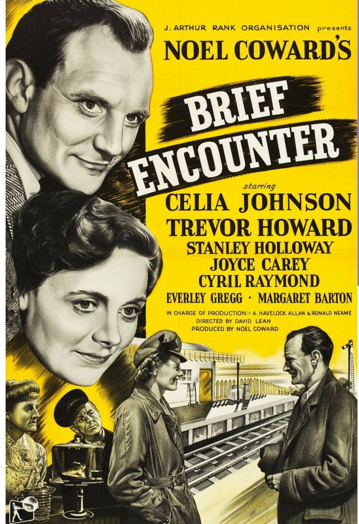
Poster for the 1945 film, "Brief Encounter"