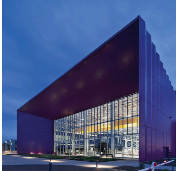
The NMIS Netherton building is designed to be carbon neutral.

At NMIS, which is operated by the University of Strathclyde, researchers use Spectra Logic® tape libraries to enable the next generation of manufacturing innovations.