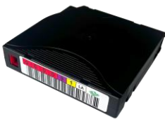
Spectra Certified Media LTO-10

Spectra Certified Media provides worry-free data protection with the highest quality LTO and cleaning media.