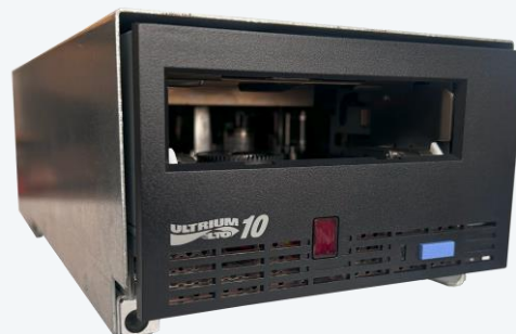
LTO-10 Tape Drive