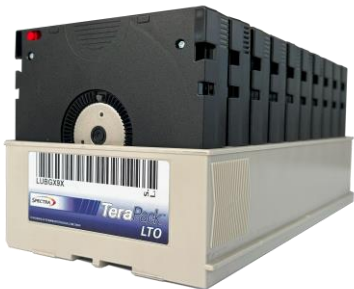
Spectra TeraPack Magazine