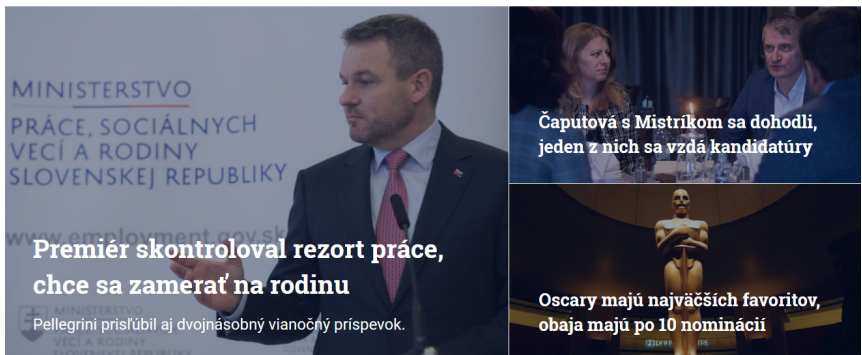
TA3’s website showcases a variety of programming