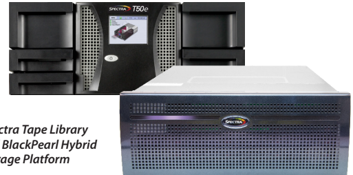
Spectra Tape Library and BlackPearl Hybrid Storage Platform