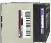
IBM® TS11XX TeraPack