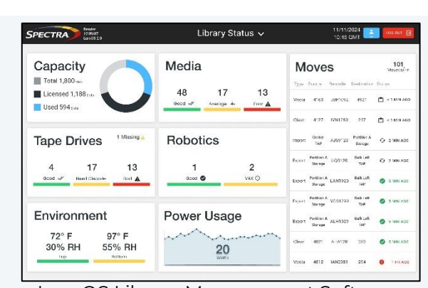
LumOS Library Management Software