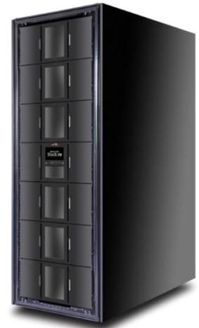
Spectra Stack library fully configured: one (1) control and six (6) expansion modules

When using Spectra Certified Media , exclusive Media LifeCycle Management features are enabled to reduce the risk of media failure or loss. All Spectra Certified Media is delivered ready for peak performance, continuously monitored for quality, and comes with a Lifetime Media Guarantee.