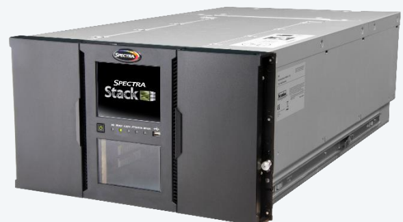
Spectra Stack Control Module