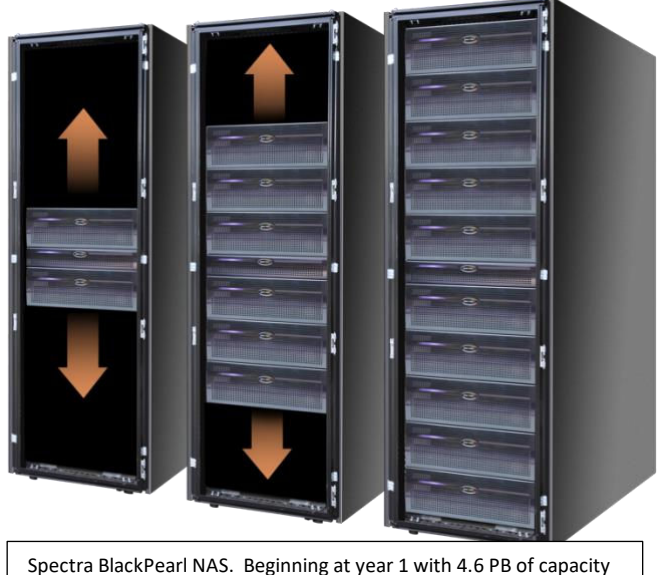
Spectra BlackPearl NAS. Beginning at year 1 with 4.6 PB of capacity and growing over 5 years to over 20 PB in a single 42U rack

Thus this customer has now created a 500TB flashonly Primary Tier platform for a fraction of the initial quotes, allowing the overall solution to fit into the budget they currently have. The total savings from this simple application of a Perpetual Tier using StorCycle is in the millions of dollars (which includes all the of cost of StorCycle and BlackPearl system and support for 5 years). But more importantly, they are able to significantly